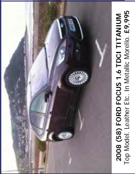
2008 (G8) FORD FOCUS 1.6 TDCI TITANIUM Top Model, Leather, Etc. In Metallic Morallo. £9,995

THE METROPOLE GARAGE NORTH ROAD, MINEHEAD TA24 5QW