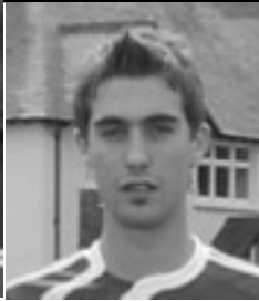
GUY BURNS A + B Photography