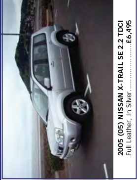
2005 (O5) NISSAN X-TRAIL SE 2.2 TDCI Full Leather, In Silver. £6,495