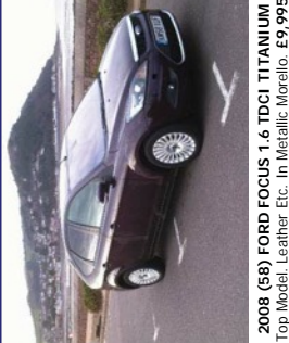
2008 (58) FORD FOCUS 1.6 TDCI TITANIUM Top Model. Leather Etc. In Metallic. £9,995

THE METROPOLE GARAGE NORTH ROAD, MINEHEAD TA24 5QW