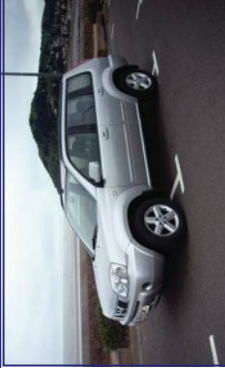
2005 (05) NISSAN X-TRAIL SE 2.2 TDCI Full Leather. In Silver.....£6,495

2009 (09) HONDA CIVIC 1.8 I-VTEC ES AUTO 10,000 Miles Only. Full Leather Trim. Top Spec.....P.O.A 2005 (55) RENAULT MODUS 1.6 AUTO INITIALE 5 Door. Low Miles. Full Leather Trim.....P.O.A 2005 (05) ROVER 25 SE AUTOMATIC 5 DOOR H/B Half Leather Trim. Alloys. A/C. 28,000 Miles Only. £3,995 2004 (54) PEUGEOT 307 1.6 SE AUTO 5 DOOR 18,000 Miles Only. Finished in Silver.....£4,695 2003 (53) FORD FUSION 1.4+ AUTO 5 DOOR MPV A/C. Alloys. Finished in Metallic Black.....£3,995